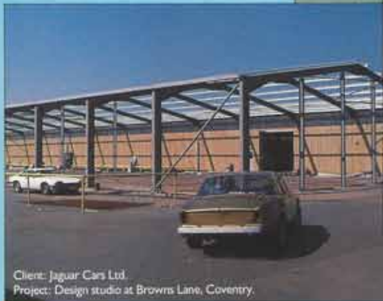
Client: Jaguar Cars Ltd. Project: Design studio at Browns Lane, Coventry.