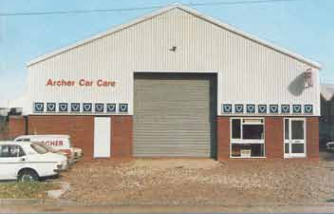
Client: Archer Car Care. Project: Vehicle repair and rust proofing workshop at Stratford-upon-Avon.