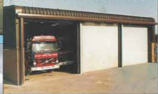
Client: Neil Bartlett Ltd. Project: Road haulage depot at Coventry.