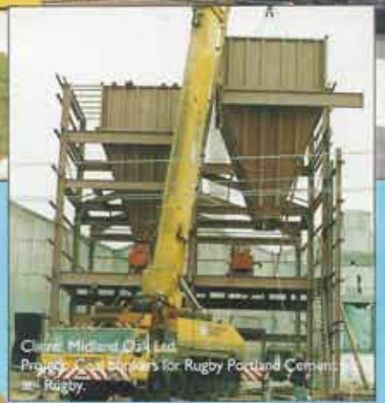
Client: Midland Oak Ltd. Project: Cold plant for Rugby Portland Cement and Rugby.