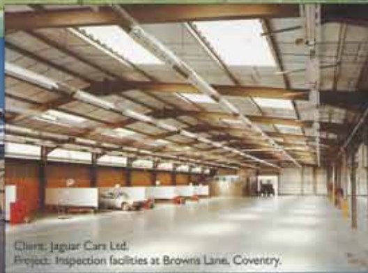
Client: Jaguar Cars Ltd. Project: Inspection facilities at Browns Lane, Coventry.