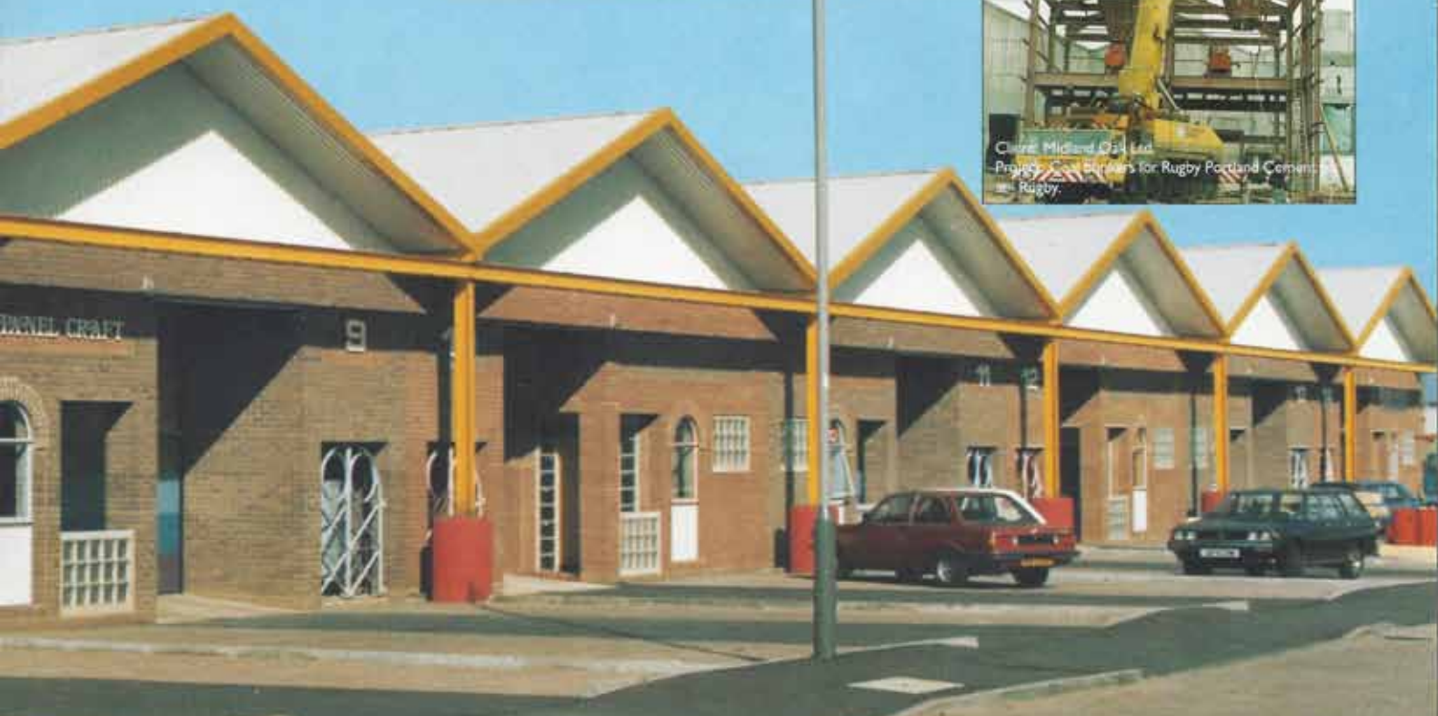
Client: Color Construction Ltd. Project: Industrial units at Avenue Farm, Stratford-upon-Avon.