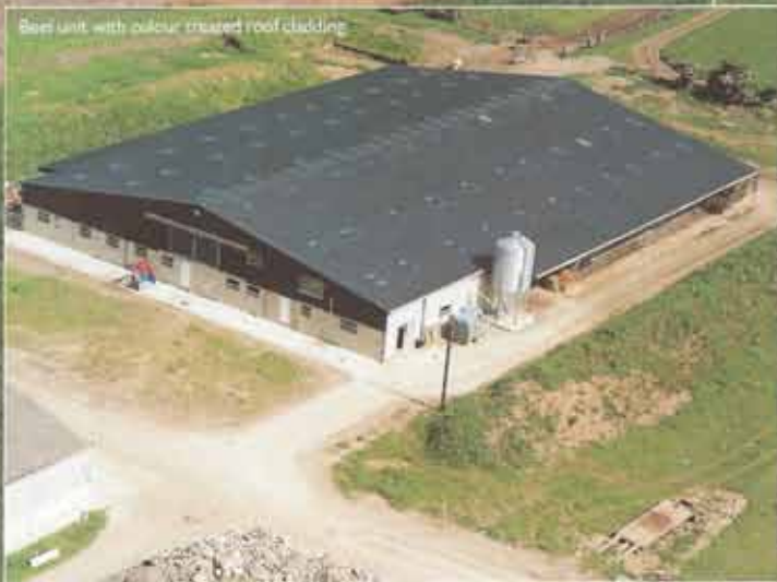
Beef unit with polycarbonate roof cladding.