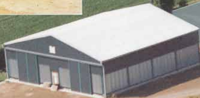
300 cow dairy unit and slurry store.