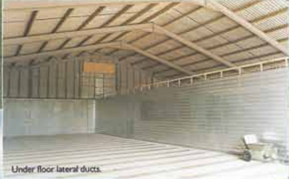
Under floor lateral ducts.