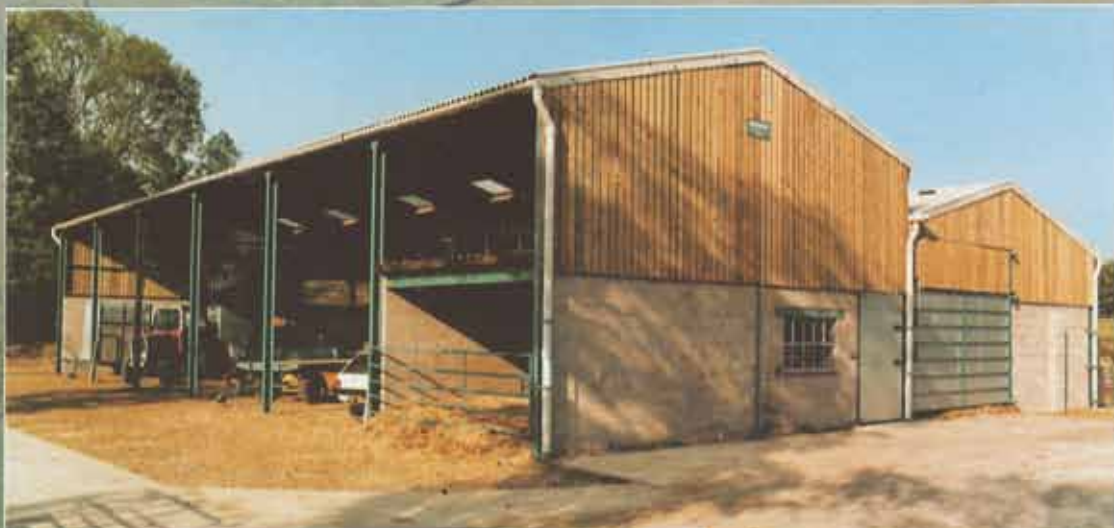
Hay and straw barn.

Formed in 1965, A.R.D. Brooker Engineering Limited has established a reputation for providing high quality steel buildings completed on time at a highly competitive price. Over the years we have built up the expertise and experience to handle all types of steel framed farm buildings. All aspects of design, fabrication, delivery and erection are the responsibility of our own fully qualified and trained staff headed by an experienced, effective and enthusiastic management team who have developed the extensive modern works incorporating our highly efficient flowline fabrication facilities. Our aim is a satisfied customer who will recommend us to others and much of our business comes in this way, both in the United Kingdom and Overseas.