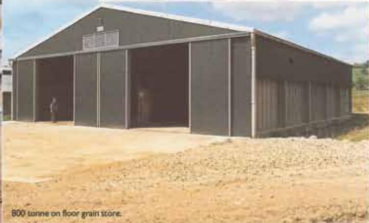
800 tonne on floor grain store.