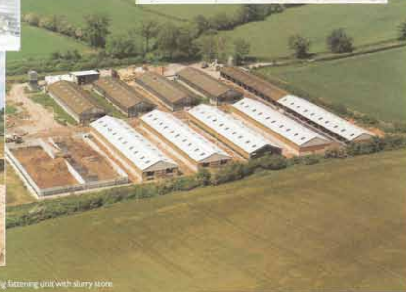
Pig fattening unit with slurry store