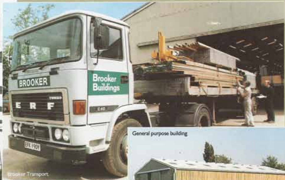
General purpose building