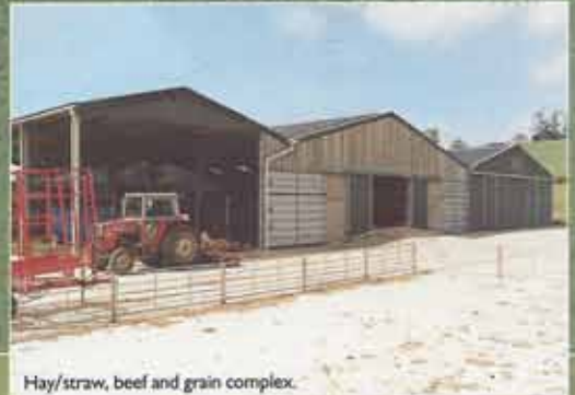
Hay/straw, beef and grain complex.